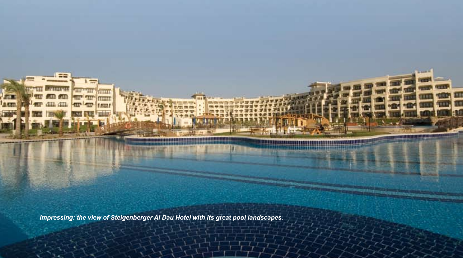
Impressing: the view of Steigenberger Al Dau Hotel with its great pool landscapes.

Travel info: Egyptian Tourism Phone 069-25 21 53, fax 23 98 76 staatlich@aegyptisches-fremdenverkehrsamt.de www.egypt.travel