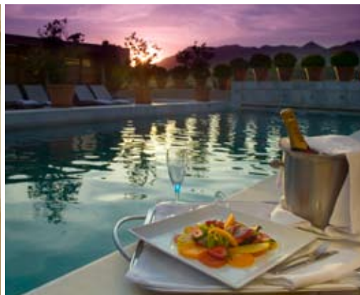
Exclusivity and intimacy offered by the 5 stars Boutique Hotel Rio Real Golf & Wellness Resort