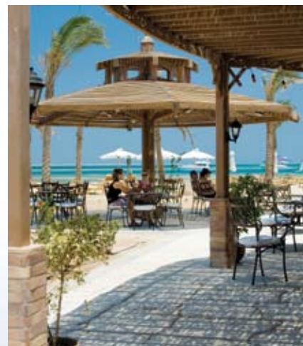
Enjoying sea view from the private sand beach and the terrace of Al Dau Beach.

At the Steigenberger Al Dau Beach Hotel GFC members get a 20% price advantage.