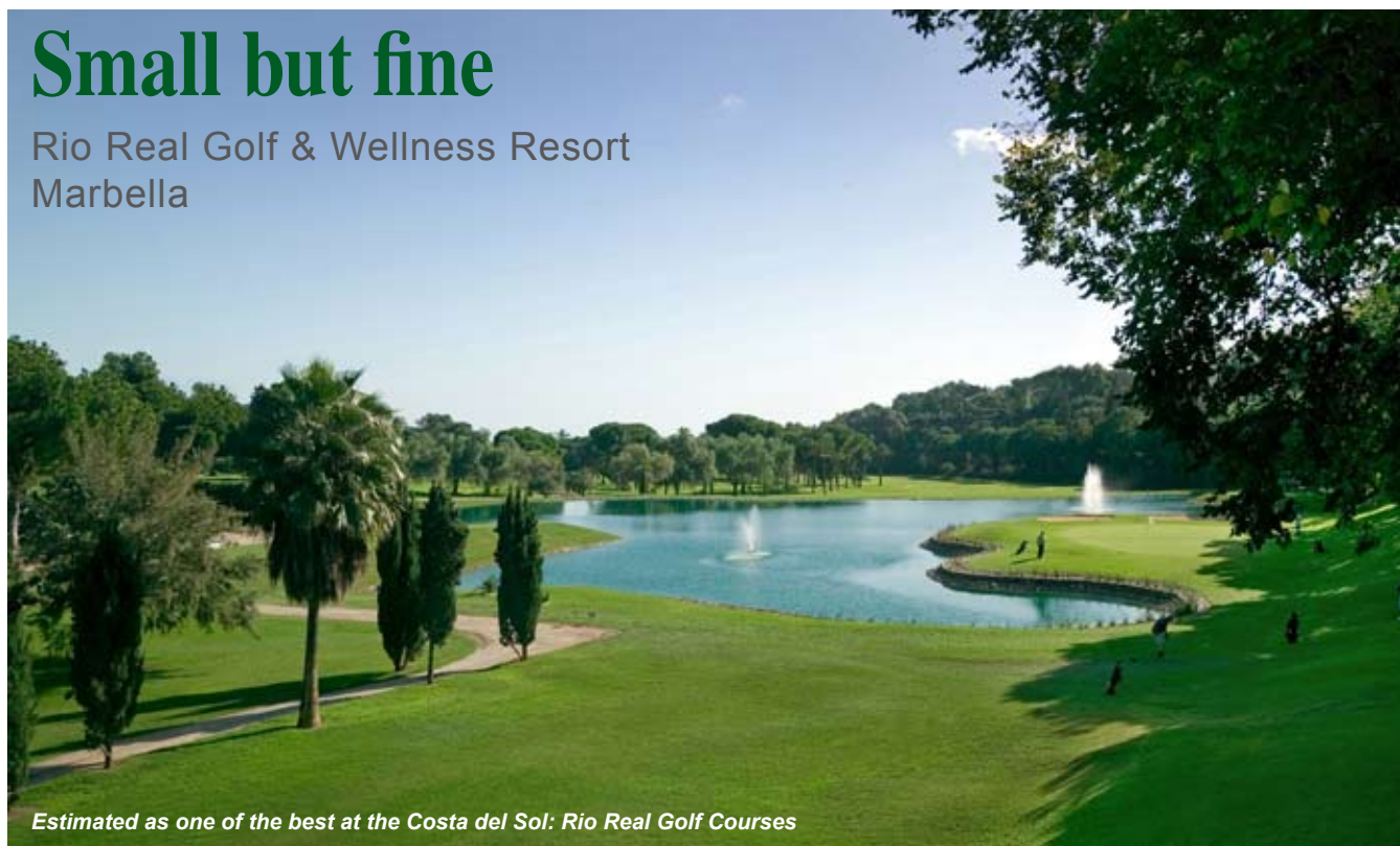
Estimated as one of the best at the Costa del Sol: Rio Real Golf Courses

Rio Real Golf & Wellness Resort Marbella