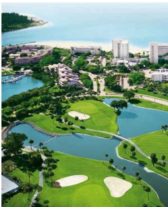
Very tricky presentation of tracks on the Islandside Golf-course in Longboat Key Club & Resort.

Along Gulf of Mexico Drive, picturesque beach houses, quaint gardens and enchanted river channels in which Manatees cavort and a coronation of first-class luxury-hotels hide. The best is undoubtedly the Longboat Key Club & Resort . If you love sun, sand and surf, there is no better place than the private, untouched white sandy beach owned by the hotel. Feel how the gulf stream tickles your toes or enjoy one of the innumer-