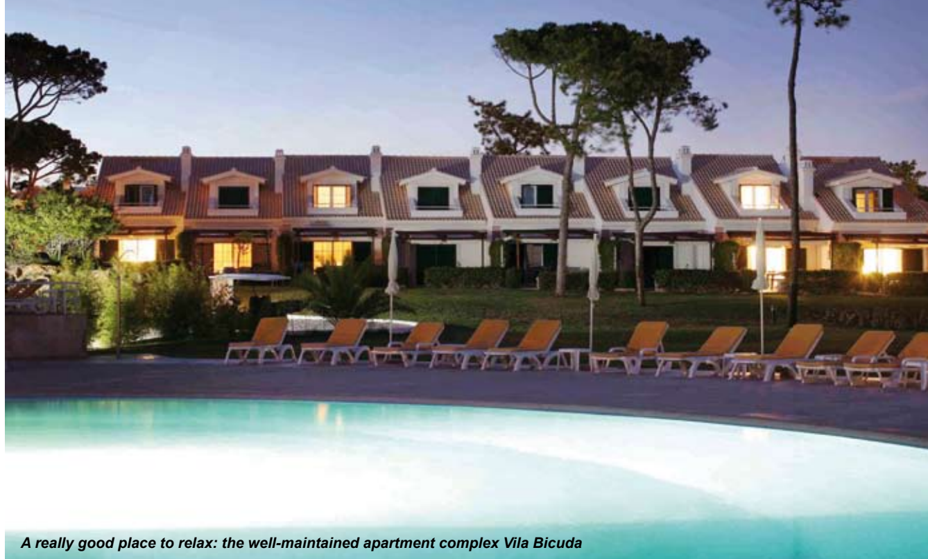
A really good place to relax: the well-maintained apartment complex Vila Bicuda

Chosen by the IAGTO (International Association of Golf Tour Operators) as the „Established Golf Destination of the Year“ in 2003 and as „Europes Golf Destination of the Year“ in 2007, the „ Lisbon Golf Coast “ offers all the conditions for the perfect golf vacation in autumn. The courses are outstanding, the price / performance ratio is civilian, the climate is mild, the gastronomy is legendary and the surrounding area is unique. Even Lord Byron called the area around Estoril & Sintra as a „Garden of Eden“. And so it is not very surprising that about 35% of all golf courses of Portugal were created in this area.