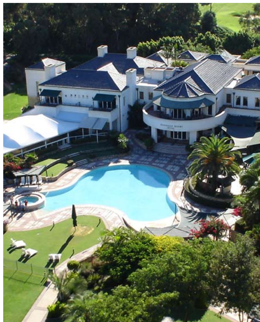
The luxurious Joondalup Resort is located directly at Australia's No. 1 Golf Course.

in a sensational way with sporting challenge. The fairways are running spectacularly through dense bush land, steep limestone quarries and along picturesque lakes. Each hole surprises, either you tee off under a 30-meter limestone or you play surrounded by the fresh breeze of the sea on undulating fairways.